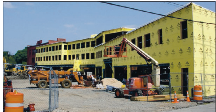
A view from Anderson Street of the back side of the Warwick Place development, which, it seems, will bring movies back to Marblehead.